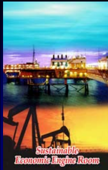
Sustainable Economic Engine Room