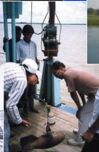
Brahmaputra river bank protection Bangladesh