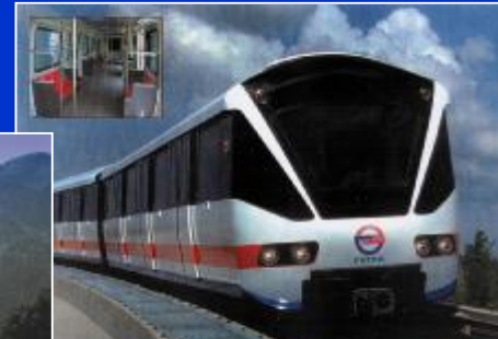
Putra LRT Malaysia