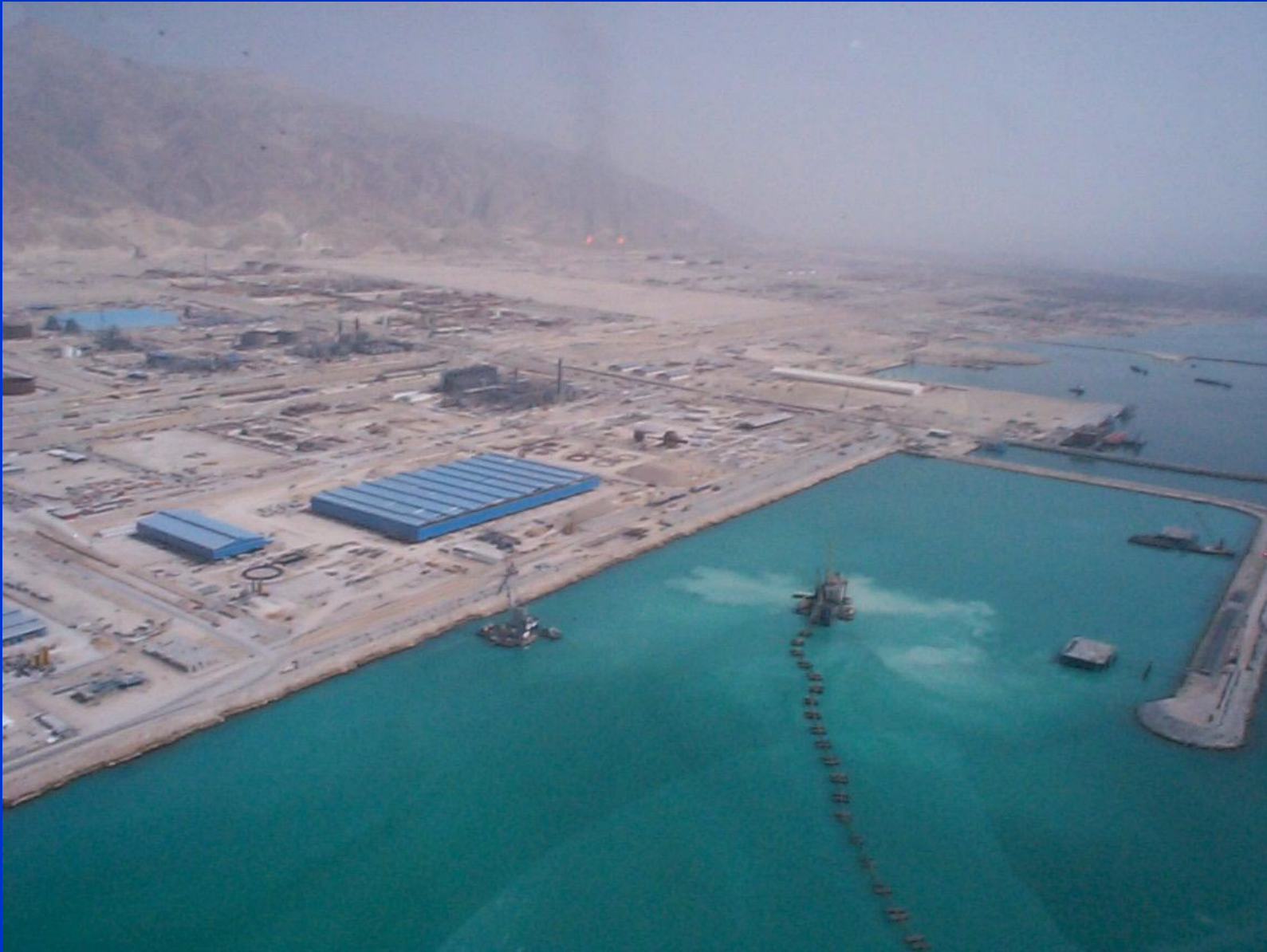
Iran: Pars Energy Zone, PSEZ Authority