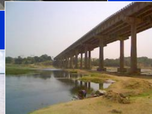
Ahmedabad – Vadodara Expressway India