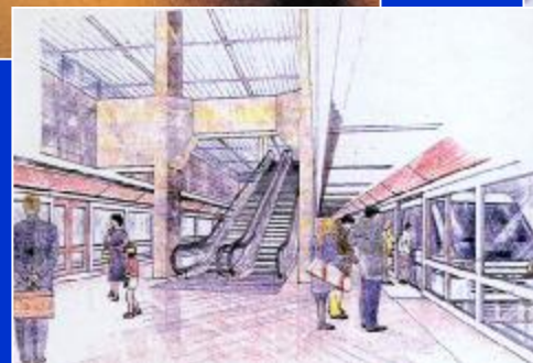
MRTA Blue Line Bangkok